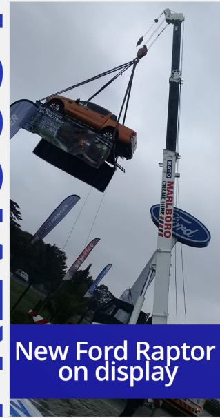
New Ford Raptor on display