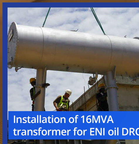
Installation of 16MVA transformer for ENI oil DRC