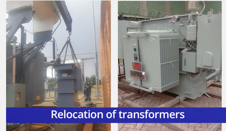
Relocation of transformers