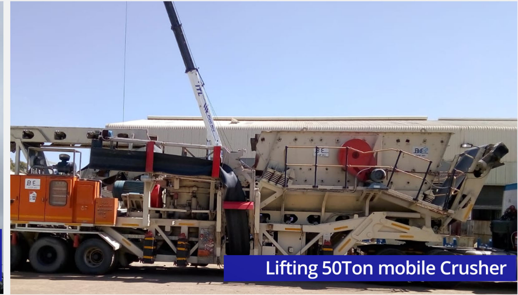
Lifting 50Ton mobile Crusher